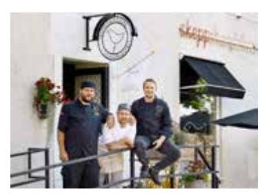
Skeppshandeln Café & Bistro, Köping. Wonderful locally produced food and top-quality fika.