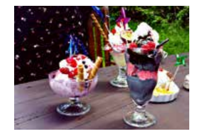
3. Glass & Berså, Arboga. The most impressive ice creams in Västra Mälardalen.